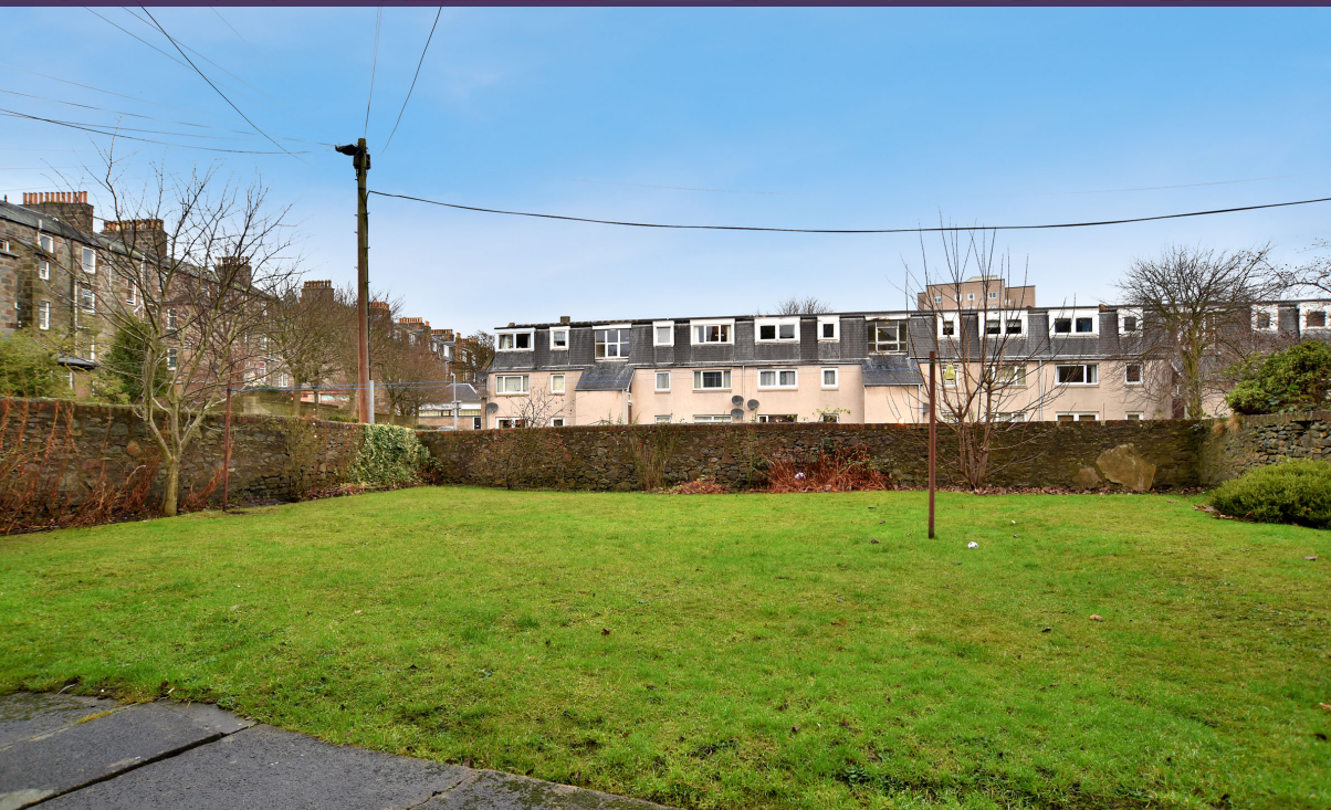
Shared rear garden

The items of furniture may be available by separate negotiation.